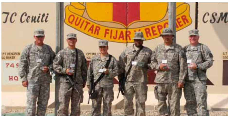
"Five recent members and an old hand displaying their SMA belt buckles and ID cards at Camp Adder, Iraq"